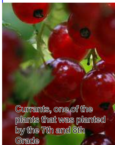
Currants, one of the plants that was planted by the 7th and 8th Grade